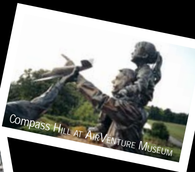
Compass Hill AT AIRVENTURE MUSEUM