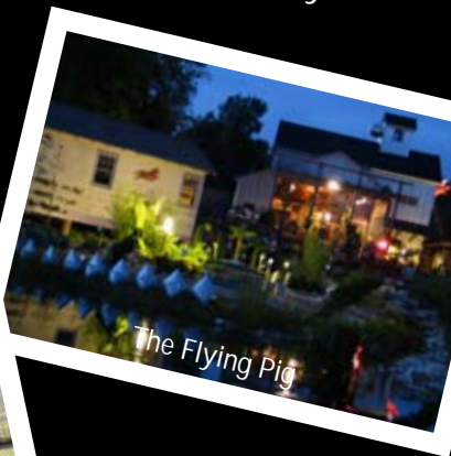
The Flying Pig